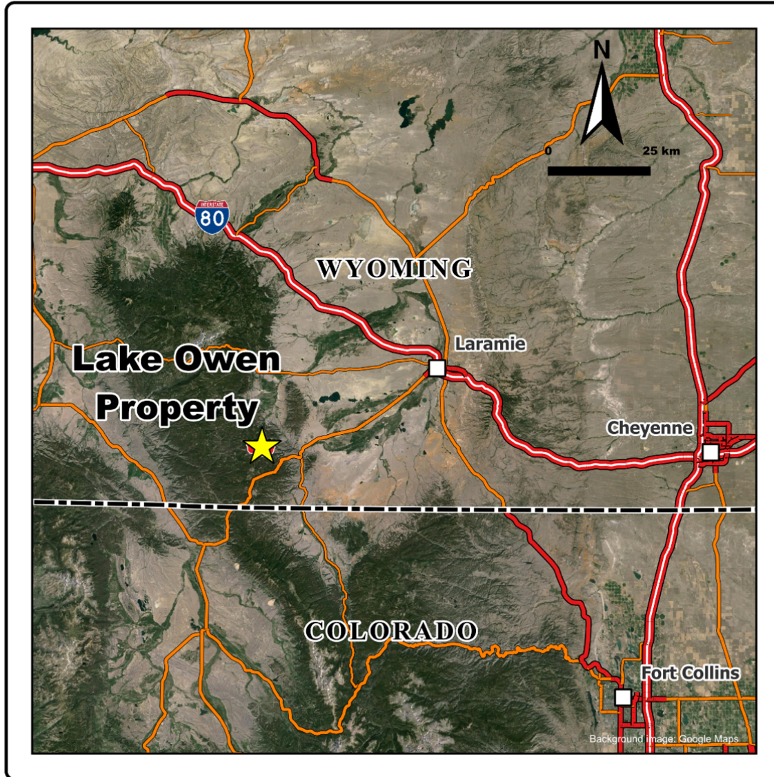
Figure 1: Project Location Map

August 22, 2024 – Vancouver, B.C., Troy Minerals Inc. (“Troy” or the “Company”) (CSE: TROY; OTCQB: TROYF; FSE: VJ3) is pleased to announce that core drilling is underway on the Company’s Lake Owen project. The Lake Owen Project is in Wyoming, USA, located approximately 50 km southwest of Laramie, Wyoming (Figure 1).